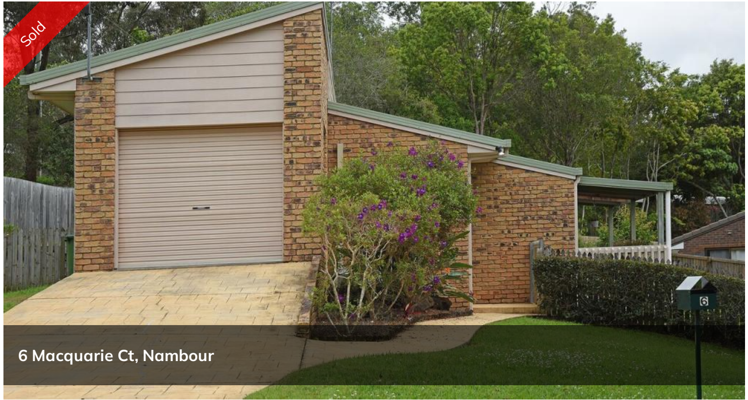
6 Macquarie Ct, Nambour