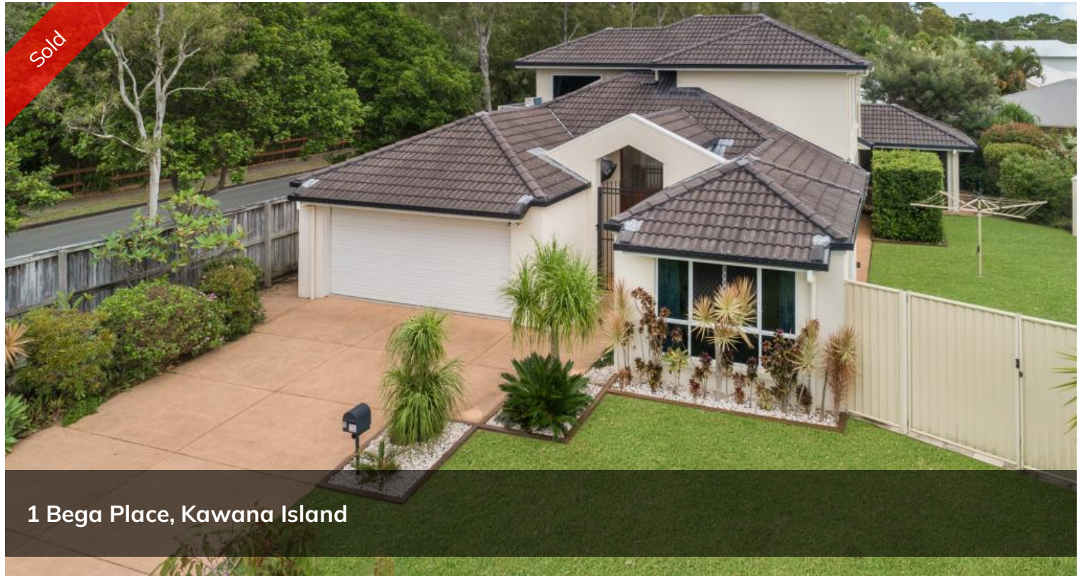
1 Bega Place, Kawana Island