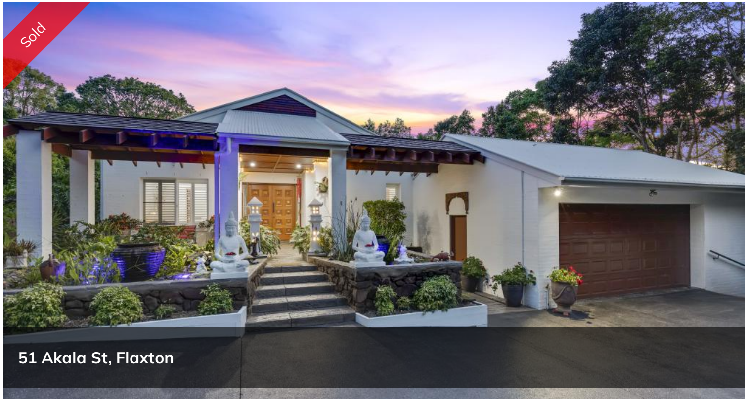
51 Akala St, Flaxton